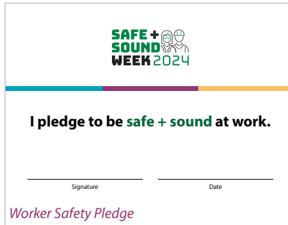
Worker Safety Pledge